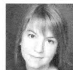
Jessie Lee Wilson Chorus