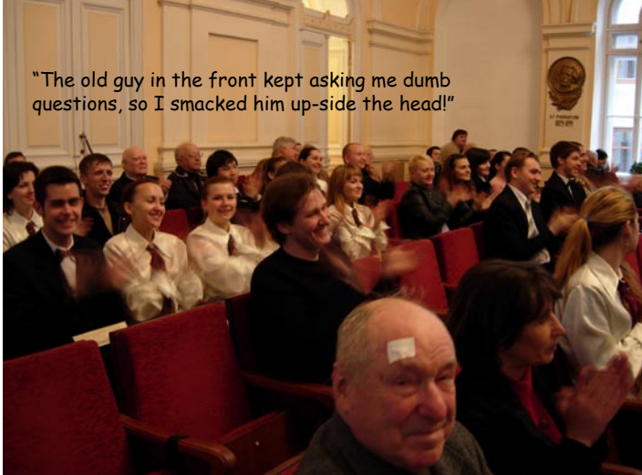
"The old guy in the front kept asking me dumb questions, so I smacked him up-side the head!"