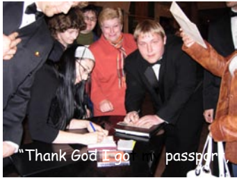
"Thank God I go passport"