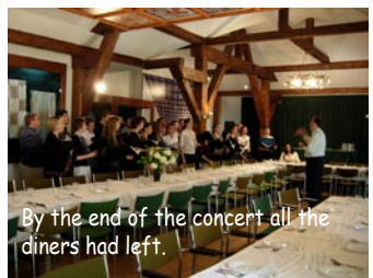
By the end of the concert all the diners had left.