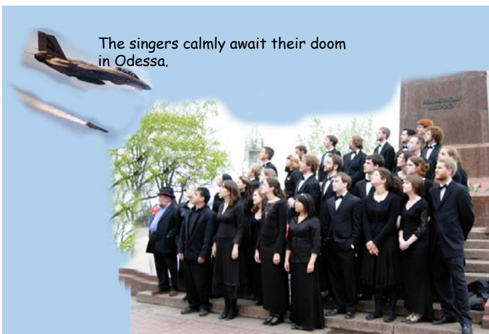
The singers calmly await their doom in Odessa.