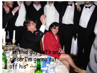
"In this guy get's any closer I'm gonna cut off his" ----