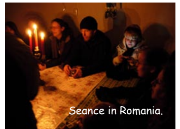
Seance in Romania.