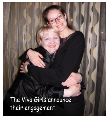
The Viva Girls announce their engagement.