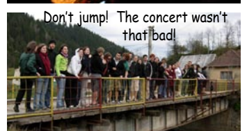
Don't jump! The concert wasn't that bad!