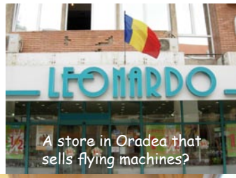
A store in Oradea that sells flying machines?