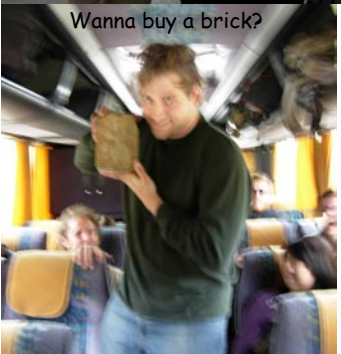
Wanna buy a brick?