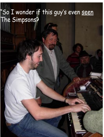
"So I wonder if this guy's even seen The Simpsons?"