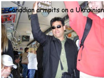
Canadian armpits on a Ukrainian