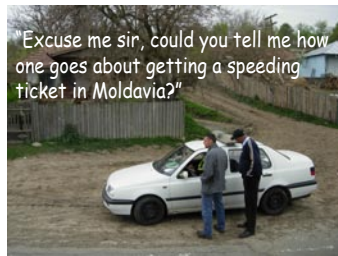
"Excuse me sir, could you tell me how one goes about getting a speeding ticket in Moldavia?"