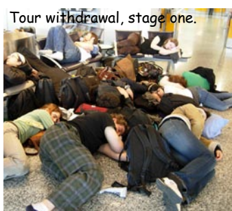
Tour withdrawal, stage one.