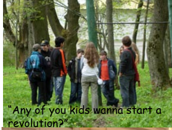
"Any of you kids wanna start a revolution?"