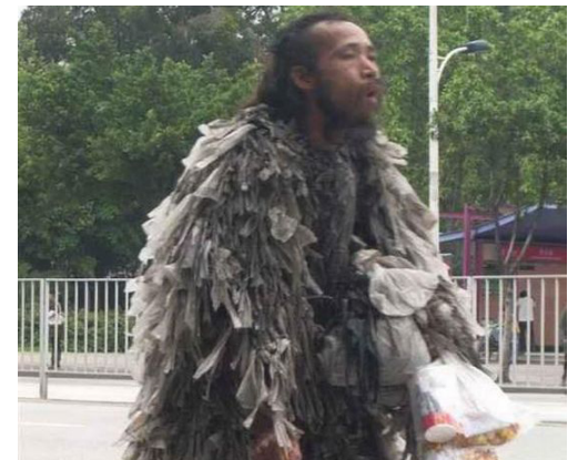
Chinese homeless man Homelessness is everywhere!

Dates for baseball games this summer have now been set: June 26, July 10, July 24 and August 7. The drop-in centre will be closed on these dates — they are all Fridays — though we will be serving dinner on those days. Please feel free to come out and join us.