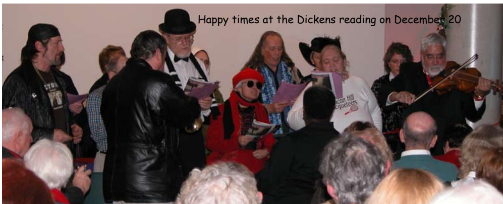
Happy times at the Dickens reading on December 20

Non-perishable foods: Canned or other dry packaged foods, coffee, peanut butter & pasta.