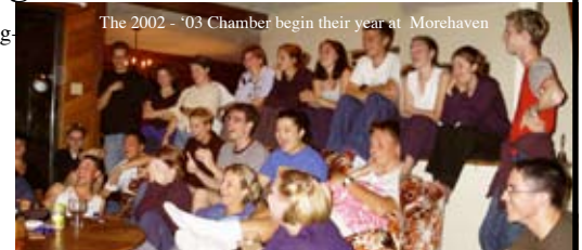
The 2002-'03 Chamber begin their year at Morehaven

We very much hope to begin a once a year Chamber Singers alumni weekend at Morehaven in summer, 2011. Please send me a note if you are interested or better still have a cohort of Chamber Singers friends who might be interested. This will help us focus on a date. Also, if you wish to contact one of your Chamber Singer friends, write me and I'll send whatever e-mail address I have.