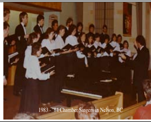
1983 - '84 Chamber Singers in Nelson, BC

http://finearts.uvic.ca/music/ensembles/chambersingersarchive/