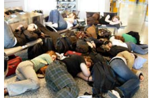
Waiting for a flight at the end of the '07 Russian Tour