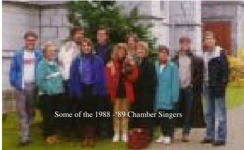
Some of the 1988-'89 Chamber Singers