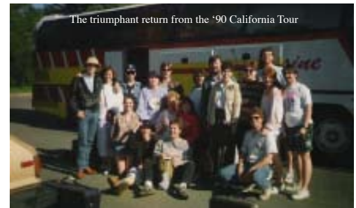
The triumphant return from the '90 California Tour

Two years in the planning, over 300 of the 450 members from the past 35 years were located and contacted. Over 150 alumni from all over North America and as far away as Korea participated in this most exciting event, held at St. Aidan's United Church in Victoria, or participated in the organization and attendance at concerts across Canada during the following weeks.