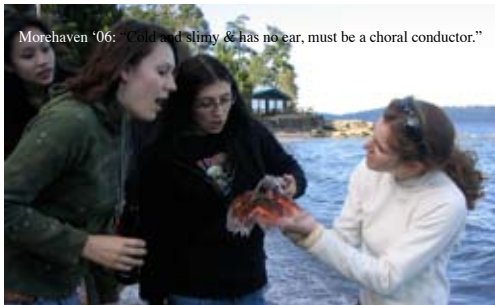
Morehaven '06: "Cold and slimy & has no ear, must be a choral conductor."