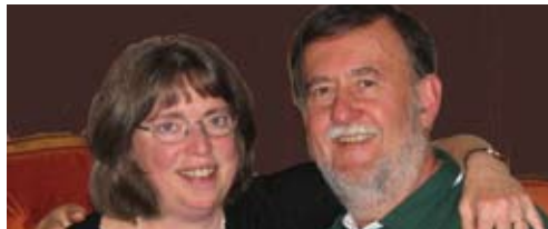
Keep track of us at: http://krunchd.com/morenews