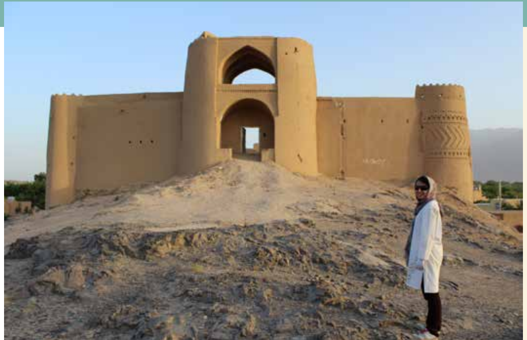
Atri Hatf in Iran, Summer 2013

Considering the Ilkhanid capital cities in the historical setting of medieval Iran, I analyze their physical and social structure on the basis of the notion of cultural interactions between the conquerors (the Mongols) and the conquered (the Iranians). Dealing with the process of cultural exchanges at the core of the project, I uncover the items, perceptions, and principles circulated between Iran and her Eastern and Western neighbours first, and then the historical figures, institutions, and events through which such transmissions happened.”