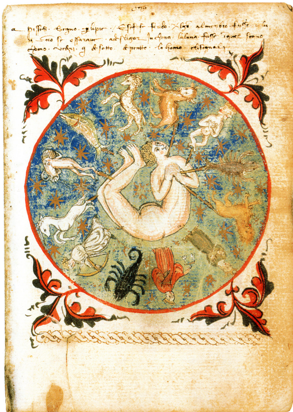
FIGURE 4 Astrological Man from Book of Michael of Rhodes, folio 103b. Venice, 1430's or 40's. Ink and coloured wash, 196 x 139 mm. Manuscript in private possession.

such as ploughing, cutting wood or shearing sheep. 43 Michael, understandably, is more interested in astronomical information in relationship to the effect of the moon, planets, and stars on tides and navigation. 44 BMR contains considerably more astrological information than da Canal , and discusses, in some detail, each astrological sign and the dominant personality characteristics associated with that sign. 45 It is also this section of Michael's book that is the most lavishly and colourfully illustrated, with a circular framed depiction of astrological man (fig. 4) and each sign of the zodiac. Michael provides a detailed calendar of a year in which every day is associated with a particular Saint, many of whom have particular meaning for Venetians. 46 Sometimes there is additional astronomical information about a particular day, such as a new moon or an eclipse, but it always follows the name of the saint whose day it is. The function of this type of calendar enables one to specifically address the saint who is being commemorated to seek their protective intervention for that day. This mixture of astronomical and