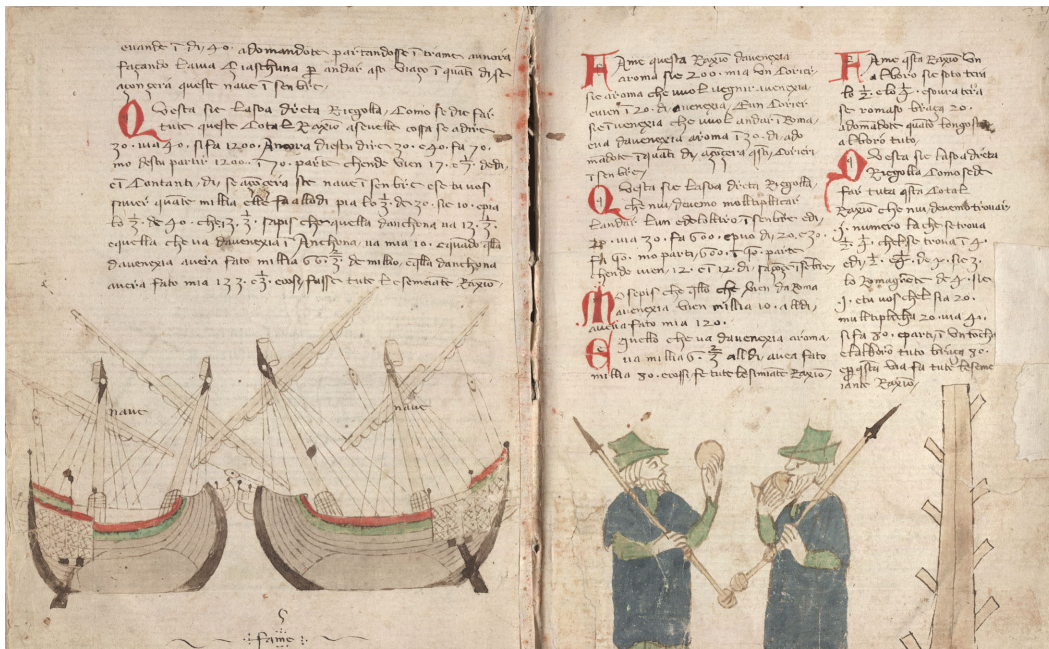
FIGURE 1 Illustrations of ships and couriers from Zibaldone da Canal , Beinecke MS 327, folios 16v & 17r. Venice, 14th century. Ink and coloured wash, 280 x 215mm. New Haven, Connecticut: Yale University.

with one exception, are placed to support a particular mathematical problem. Of the fourteen representational drawings, five each are of ships and towers. The content is an eclectic mixture of the following: conversion lists of currencies, weights and measures for many areas in Italy and the Mediterranean, with related information about goods and raw materials; mathematical problems involving arithmetic and geometry; literary selections; healthcare and medical information, which can also include astrological and calendric references; historical information about Venice; spiritual and didactic passages such as the Proverbs of Solomon.