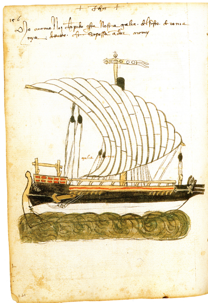
FIGURE 2 Galley Under Sail from Book of Michael of Rhodes , Folio 156a. Venice, 1430's or 40's. Ink and coloured wash, 196 x 139 mm. Manuscript in private possession.

Therefore, this article will add to the scholarship around these two manuscripts by placing them within a specific Venetian cultural tradition to explain both the content and its purpose. This in no way invalidates the existing scholarship but rather provides an additional dimension that helps us to understand, not only why these codices were created as they were, but also