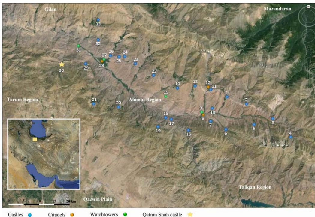
Figure 4: Schematic map of the distribution of fortifications in the Alamut region Google Earth, Google, Landsat2014

evidence of significant construction phases long before the Isma‘ilis took control of them. In these cases the Isma‘ilis modified and strengthened the castles, based on their requirements.