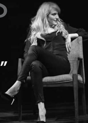
HELENE JOY IN SPEAKING IN TONGUES