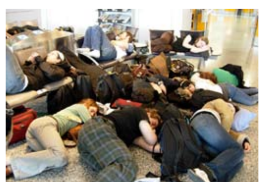
Waiting for a flight at the end of the '07 Russian Tou